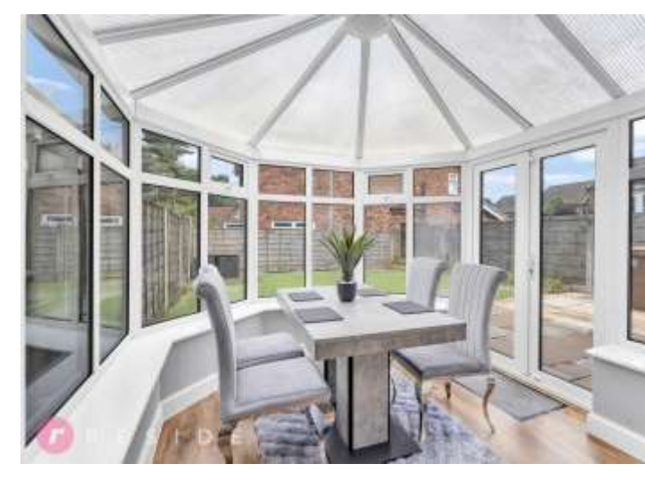
To view this property call Reside on 01706\ 356633